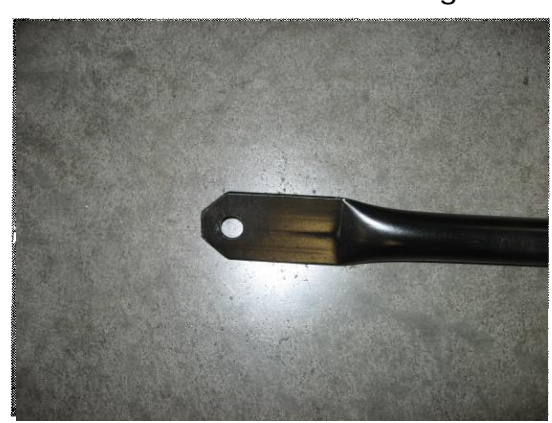
TANK BRACE- Short smash

Using (1) 3/8" x 1 1/4" hex bolt, (1) 3/8" flat washer, (1) 3/8" lock washer and (1) 3/8" hex nut, connect each TANK BRACE to the tabs provided on the BRACE CLAMP. Make sure to insert the hex bolt with threads pointing in toward center of the BRACE CLAMP. Flat washer goes on the bolt head side. Lock washer goes on hex nut side. Do not tighten bolts yet.