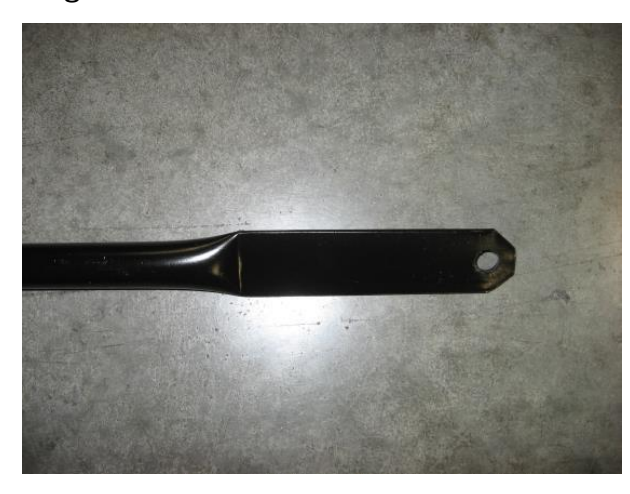
TANK BRACE- Long smash

Attach TANK BRACES to back of BASE TANK. Locate one threaded insert on the left and right sides of the BASE TANK near the back. Using (1) 3/8"x 1" hex bolt, (1) 3/8" flat washer and (1) 3/8" lock washer, loosely attach TANK BRACE (long smash end) to back of BASE TANK. Do not tighten bolts.