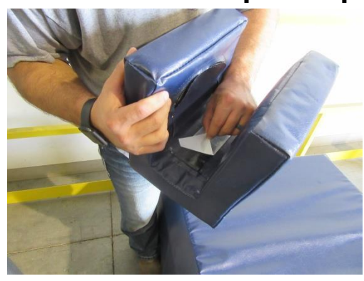
Extension neck pad installed below.

Install the extension neck pad as shown below. Be sure to peel the backing off the adhesive velcro and press in place as shown below.